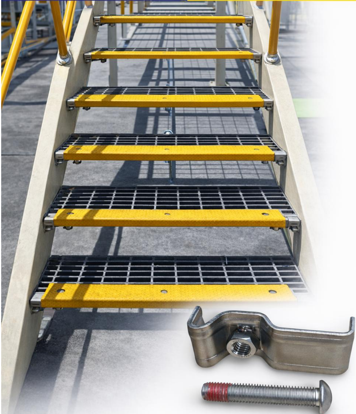
SPG Saddle Clip Fixing Assembly